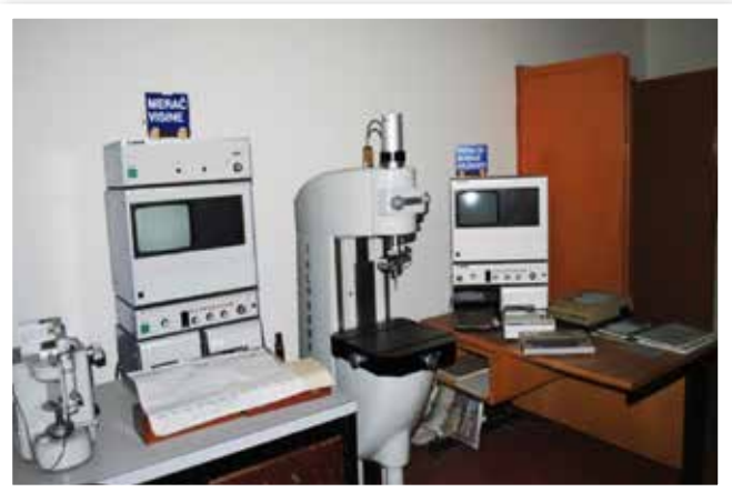
Machine for testing circularity and roughness HOBBSON & TAYLOR (England)