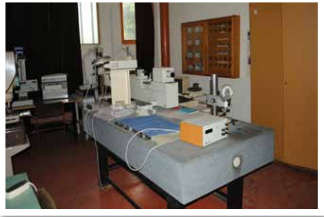
Three-dimensional testing machine Mitutoyo Japan