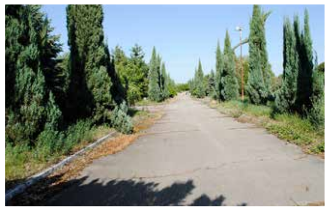
Infernal traffic routes (roads)