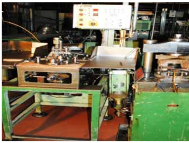
Machines for control, manufacturer: Institute "Mihailo Pupin"